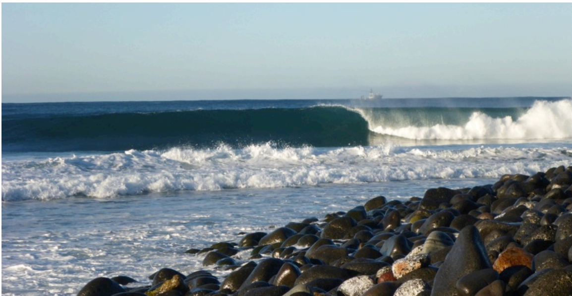
A rare empty one at San Miguel, Baja Norte, December 2015