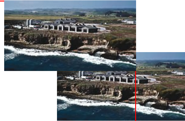
Aerial of Long Marine Lab (Lezin)

Long Marine Laboratory (LML) is an oceanside research facility located on a coastal site overlooking Monterey Bay National Marine Sanctuary . The lab provides facilities for scientists who require running seawater, large marine mammal pools, and seawater labs to conduct their research. The close proximity of the lab permits ease of integration of activities with the campus' instructional and research activities.